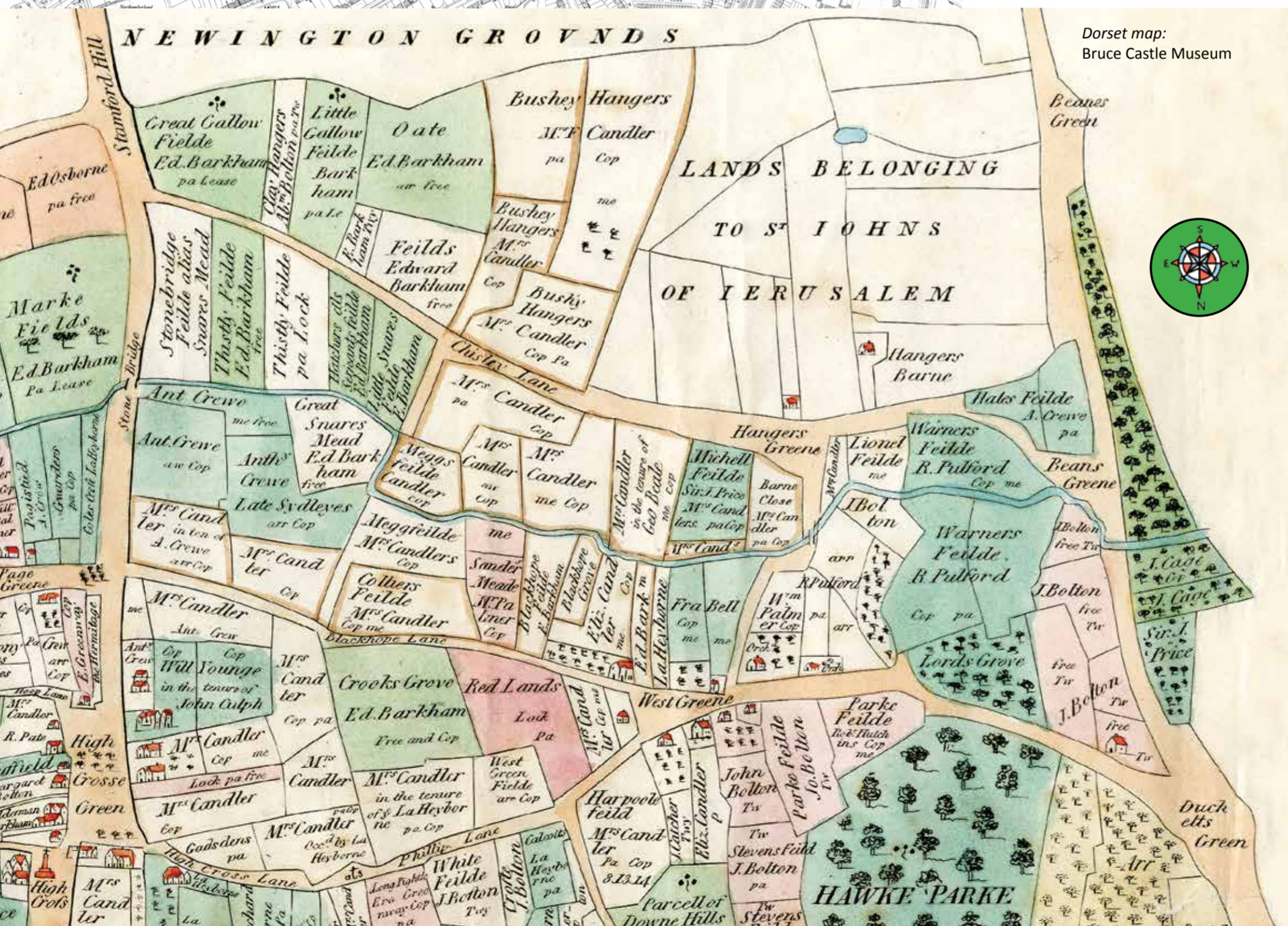
Dorset map: Bruce Castle Museum