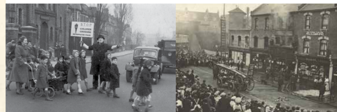
Children in Philip Lane 1950s © Alan Swain