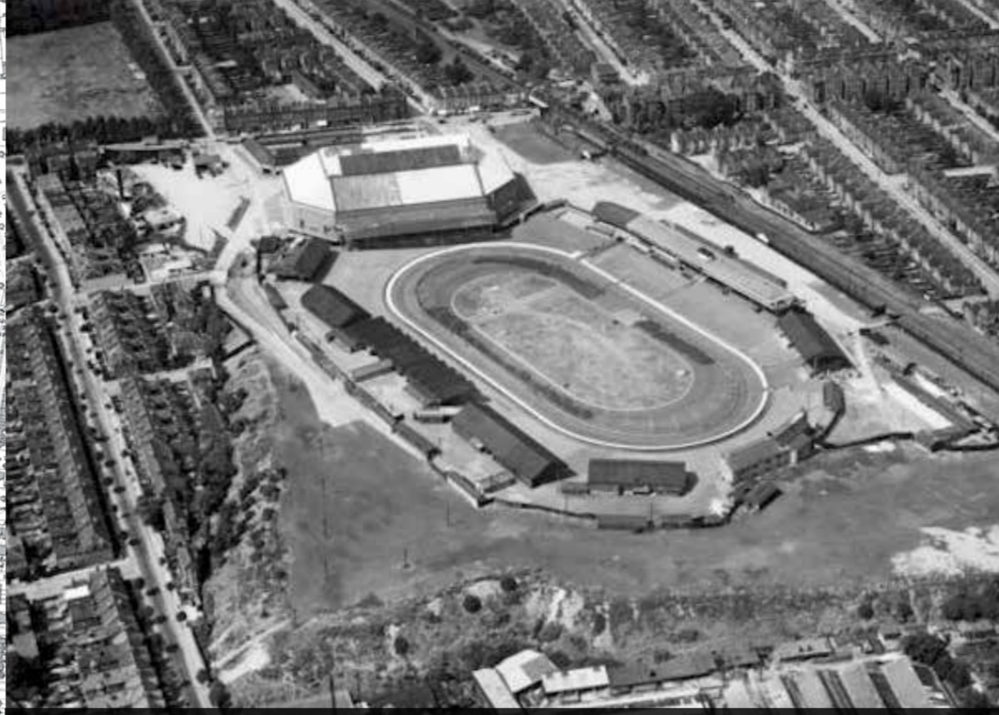
Harringay Stadium

Times, people and places change. But maps show the ground on which we live remains the same. There are traces of the past to be found all around us.