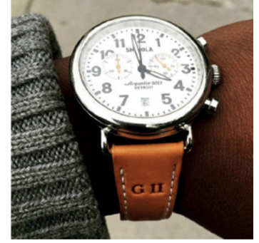
36 Shinola B4