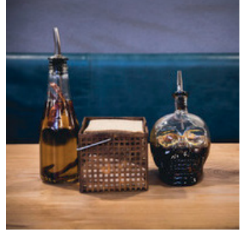
12 Homeslice A3