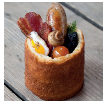
8 Bunnychow C5