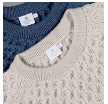
37 Sunspel D4 & C5