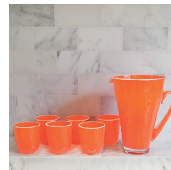
7 Summerill & Bishop B4